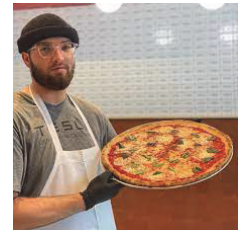
(make a pizza)

25) How much water was there in the glass?